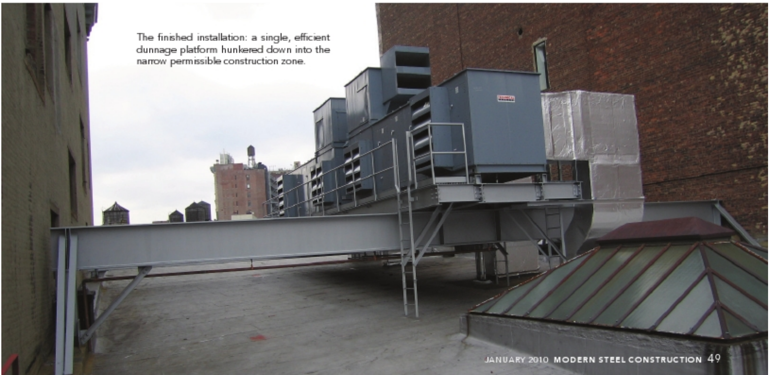
The finished installation: a single, efficient dunnage platform hunkered down into the narrow permissible construction zone.

Though far exceeding the average dunnage platform in both complexity and scope, the project remains a point of pride for other reasons, as well. Structural engineers, in most cases, don't get many chances to unleash their creative imagination in the design process. Often we are called upon